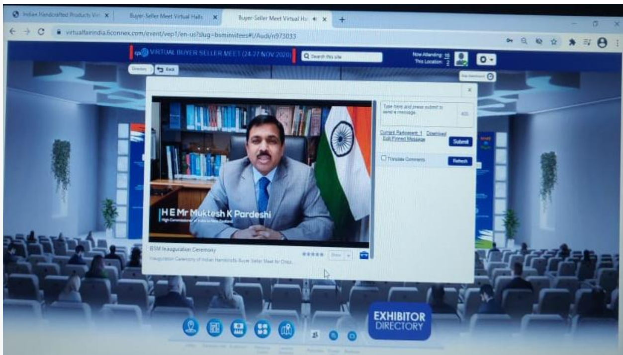
PHOTO 3 - H. E. MR. MUKTESH K. PARDESHI, HIGH COMMISSIONER OF INDIA TO NEW ZEALAND, GOVERNMENT OF INDIA SPEAKING ON THE OCCASION OF INAUGURATION OF BSM IN NEW ZEALAND AND AUSTRALIA