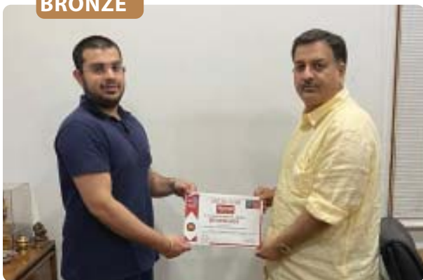
M/s. Madhava Manufacturing Company, Moradabad