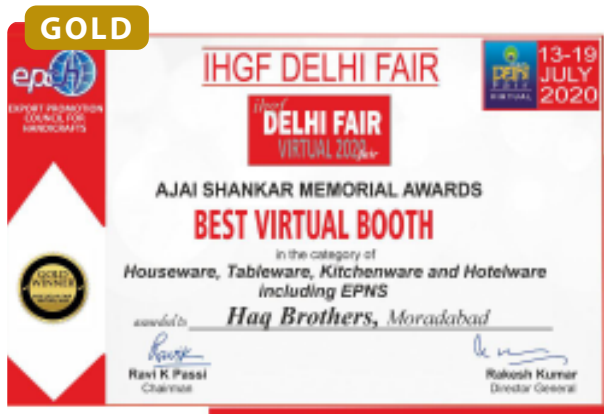
M/s. Haq Brothers, Moradabad