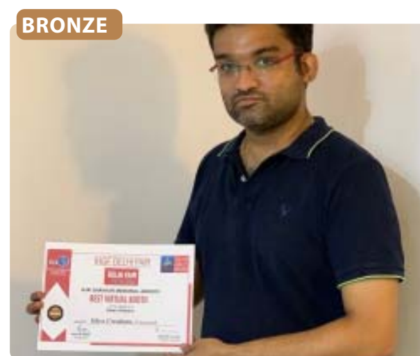
M/s. Glass Creations, Firozabad