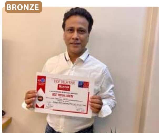
M/s. Exmart International Pvtl Ltd., Greater Noida