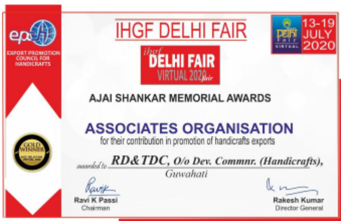
Regional Design & Technical Design Centre O/o DC(Handicrafts)- North Eastern Region for being the associated institute in motivating entrepreneurs from NER to participate in the fair