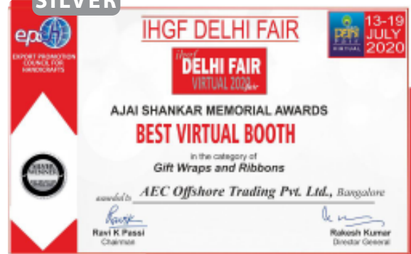
M/s. AEC Offshore Trading Pvt. Ltd., Bangalore