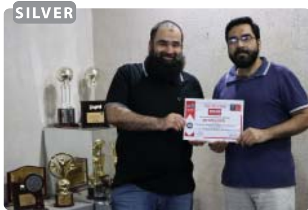
M/s. Paramout Home Collection, Moradabad