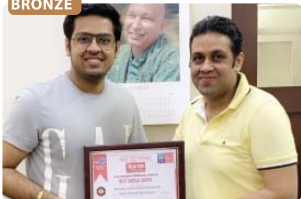
M/s. Globe Metals & Glass Exports, Moradabad