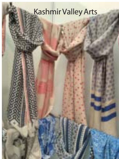
Kashmir Valley Arts

different variations that they have in these products. In one they use 100% silk, in another the base is made from base threading and then it is layered on with cotton and silk. It's a family tradition. Their major importers are from European countries and USA. To keep their interest intact, new designs like those inspired by Persian designs and 3d designs are being introduced by this firm. EPCH is