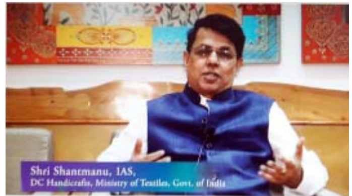
Mr. Shantmanu, Development Commissioner ( Handicrafts), Ministry of Textiles, Govt. of India, speaking at the inauguration of the NER Pavilion at IHGF Delhi Fair-Virtual 2020

A beautiful display of these design elements was located virtually in the NER Theme Pavilion at IHGF Delhi Fair-Virtual 2020. With a team of 26 artisans and entrepreneurs, this collective display, anchored on green design sensibilities, included crafts from Arunachal Pradesh, Assam, Manipur, Tripura, Mizoram, Meghalaya and Nagaland. This included, cane & bamboo lines, kauna grass and sital patti products, home decor, textile crafts, cushion covers, table mats, runners, baskets and bins, bamboo home utility products, pottery crafts, lamps, macrame decoratives,