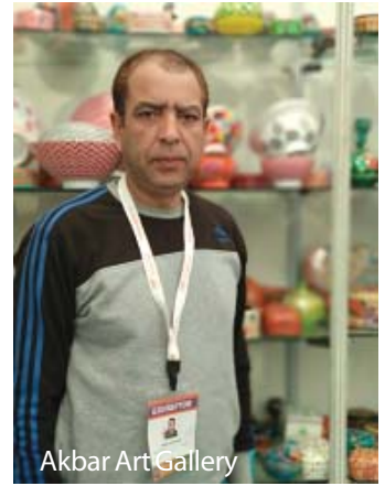
Akbar Art Gallery

different variations that they have in these products. In one they use 100% silk, in another the base is made from base threading and then it is layered on with cotton and silk. It's a family tradition. Their major importers are from European countries and USA. To keep their interest intact, new designs like those inspired by Persian designs and 3d designs are being introduced by this firm. EPCH is