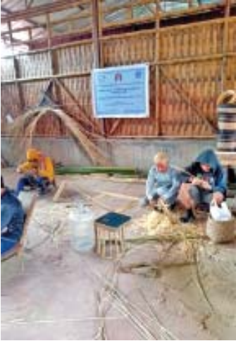
people and by the people'. It encourages local entrepreneurship and self-employment opportunities and directs the potentials of locally available skills for meeting basic community needs