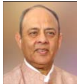
Ravi Kapoor Secretary, Ministry of Textiles, Govt. of India

IHGF Delhi Fair offers a unique opportunity for all segments