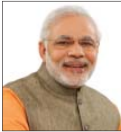
Narendra Modi Hon'ble Prime Minister of India

Our artisans and craftsmen are proud inheritors of the legacy of artistic excellence. While maintaining local flavour in manufacturing handicrafts, our craftsmen should focus on making them globally competitive with technological upgradation and concern for eco-friendly dimensions. IEML would provide an ideal platform to display skills and showcase products. I am sure that this edition will give a boost to the handicrafts sector. My best wishes for all-round success of the fair.