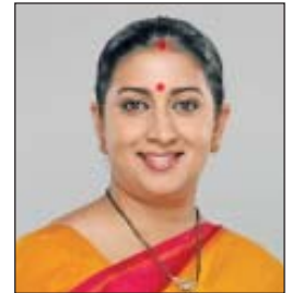
Smriti Zubin Irani Minister of Women & Child Development and Textiles, Govt. of India

Participation of entrepreneurs/exporters from different regions of India with their unique provides an opportunity to visiting buyers from across the globe to identify products from India as per their requirements. Indian handicrafts with their exquisite artistic work showcasing our cultural heritage & traditions in the form of colours, materials, shapes and designs make our crafts popular in international markets. Various