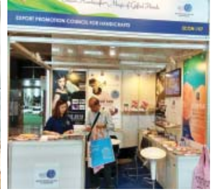
The EPCH Publicity Booth being visited by buyers and other trade visitors