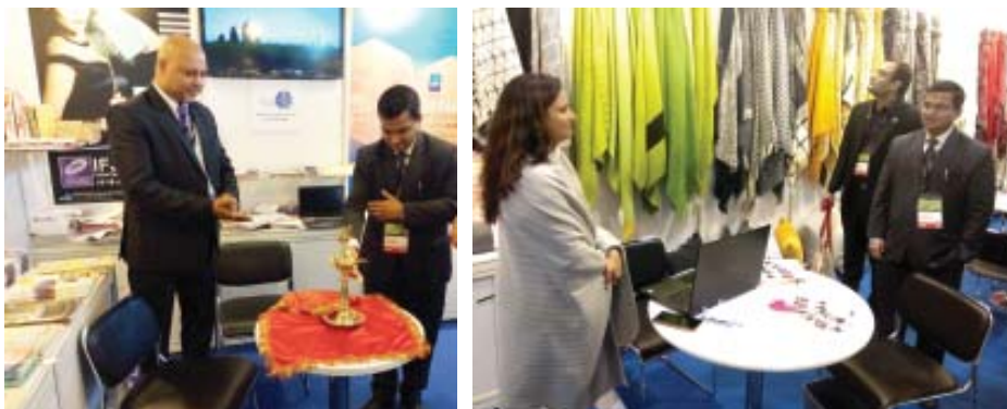
The India Pavilion was inaugurated by Mr. Karun Bansal, Consul Commerce, Consulate General of India, Hong Kong. He also met the participants in the pavilion.

A global trendsetter in business and leisure, Hong Kong's robust economy, world-class infrastructure and facilities, open-market policies and free flow of information give it a local business edge with global appeal. Hong Kong as an emergent trade platform features prominently among EPCH's selected destinations for its aggressive marketing strategy through participation in specialised trade fairs.