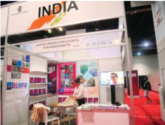
The EPCH promotional booth at Source Direct, displaying and distributing promotional as well as informative material

ASD Market Week, Las Vegas, USA; 30th July to 2nd August 2017