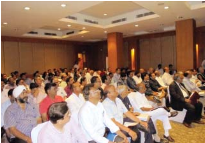
Eminent members of exporting fertility and buying agents at the seminar