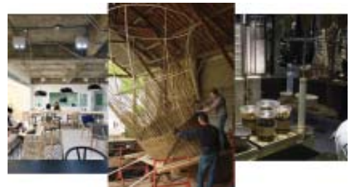
Designers collaborating across continents