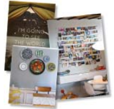
Consumers exploring the world

The evolution of connectivity, both real and virtual, are driving the Kinship trend – a growing sense of community and cultural sharing where we will increasingly seek to break boundaries, and art and design will seek to become borderless, propagating ideas to different parts of the world. Storytelling will become more important, as data and design are combined, connecting people around products and projects that tell vivid tales of places, histories, and cultures.