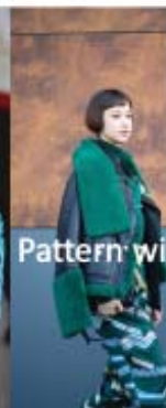
Pattern will take center stage