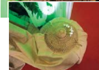
Eri & Muga Silk