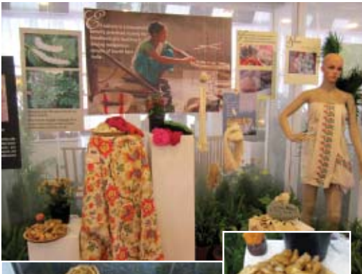
Kauna Grass & Sitalpatti