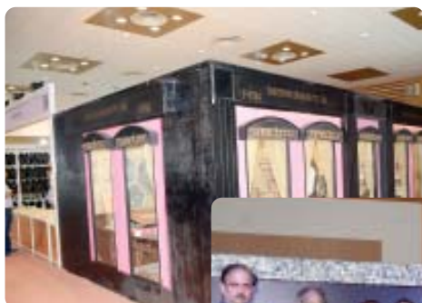
BRONZE M/s. Haritsons Designs (P) Ltd., Jaipur