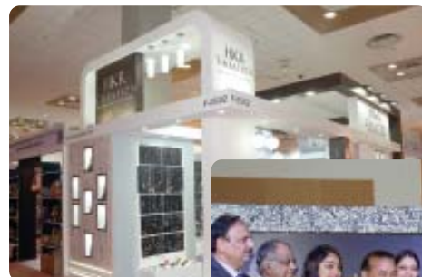
SILVER M/s. H.K.R. Creation, Mumbai