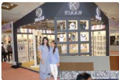
GOLD M/s. Ozar Industries, Gurgaon