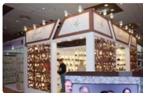
GOLD M/s. Amrish Creations, Delhi