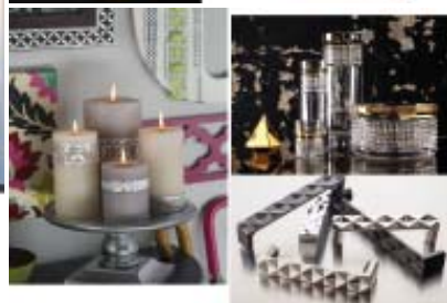
Jewellery inspired facets