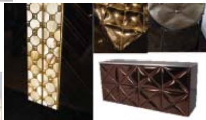
Hard surfaces take on tufted illusion