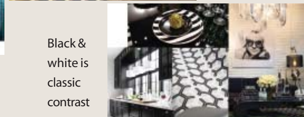
Black & white is classic contrast