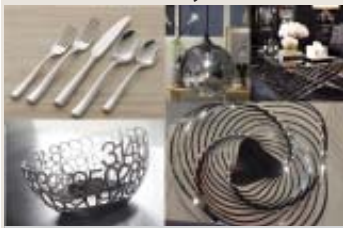
Metals are classic yet bold