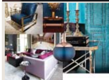
An electric shade of teal, rich azure, and mixed mauves with saturation