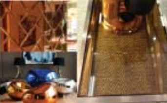
Mirrored finishes in new ways