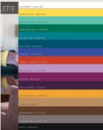
Vivid shades of malachite compliment flashy yellow pairs against black; Magenta is intense and vivid, and blue gets emboldened