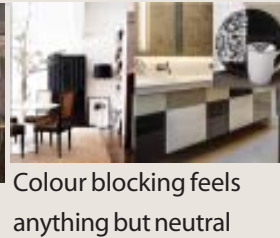
Colour blocking feels anything but neutral