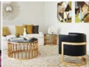
Transitional design looks back in time to the warmth of 1970s drawing in elements of confident glamour with comfortable elements