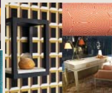
Carmine red with orange helps black with brown feels new again