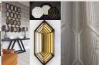
Ogees get squared off