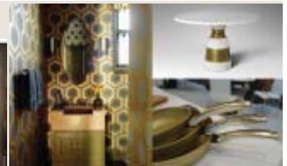
Brushed brass with soft texture