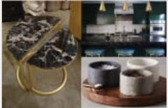
Marble brings a lux touch