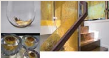
Glass goes gorgeous mottled with gold