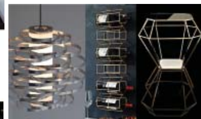
Faceted forms for shapes