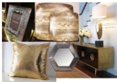
Snakeskin textures bring the glam