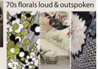
70s florals loud & outspoken