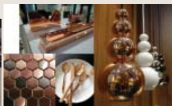
Polished copper adds warmth