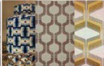
Squares go dimensional