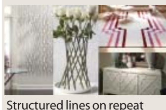
Structured lines on repeat