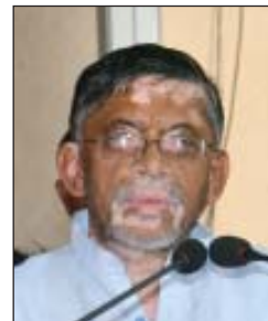
Mr. Santosh Kumar Gangwar Minister of State for Textiles, Govt. of India

In his address, Mr. Santosh Kumar Gangwar said that our textiles and handicrafts sector have achieved a significant position today, attracting buyers from all parts of the world. "Owing to our distinct products and some of our signature crafts that find no parallel world over, we can make our buyers believe that our products can give them a new direction," he emphasized and added, "moreover, our industry is supported by a strong skill base. We can combine this with tourism and flourish." The Minister also said, "EPCH has done a commendable job in the past several years in making IHGF an important instrument for marketing Indian