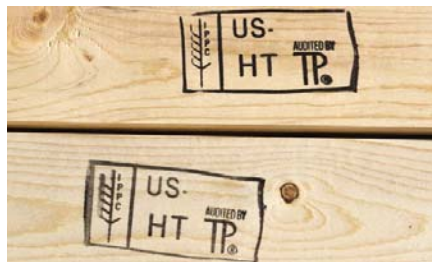
The IPPC seal

International Standards For Phytosanitary Measures No. 15 (ISPM 15) is an International Phytosanitary Measure developed by the International Plant Protection Convention (IPPC) that directly addresses the need to treat wood materials of a thickness greater than 6mm, used to ship products between countries. Its main purpose is to prevent the international