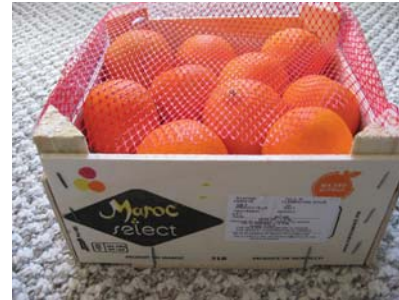
Wooden crate of clementines (mandarins) from Morocco, showing the ISPM 15 logo in the lower left corner (MA for Morocco, from the French "Maroc") in 2010

Wood packaging materials must be debarked prior to being heat treated or fumigated to meet ISPM 15 regulations. The debarking component of the regulation is to prevent the re-