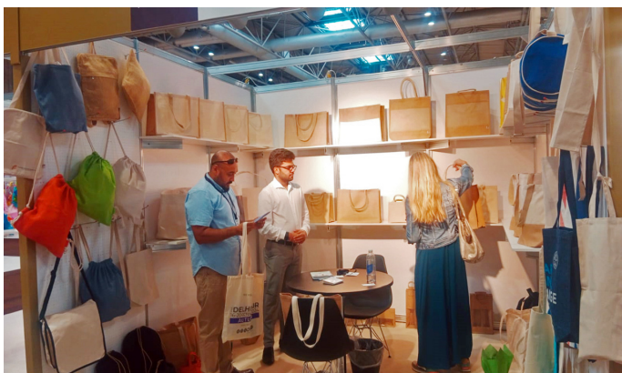
Business visitors interacting with EPCH exhibitors in the EPCH India Pavilion during Autumn Fair International

EPCH regularly exhibits at Autumn Fair International as this provides an insight into the UK market's versatility. The United Kingdom, being one of the world's major markets, holds vast potential for handicrafts and gift items. India's participation in the