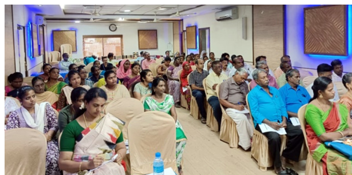
A glimpse of the participants at the program