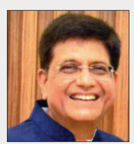
Shri Piyush Goyal Union Minister of Commerce & Industry, Consumer Affairs, Food & Public Distribution and Textiles, Goyt. of India

The fair aligns with the vision of Hon'ble Prime Minister Shri Narendra Modi ji's 'Vocal for Local' and 'Local goes Global,' representing a commendable step towards showcasing our products and benefiting India's handicrafts sector. In this context, the necessity for effective brand marketing becomes relevant to instill a desire for these products, thereby fostering increased demand. The fair will serve as an ideal platform for the