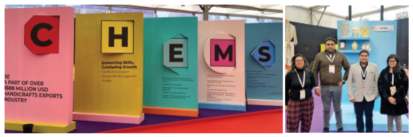
The CHEMS showcase at IHGF Delhi Fair-Spring 2024 with products from some of its alumni who are now exporters

season while keeping in mind the importance of colours, trends, etc. The government schemes and processes regarding export were simplified with the help of CHEMS and made it easier for us to expand. Not only theory, but industrial and practical exposure and assistance in exhibition fairs like this one have been extremely helpful. Some of us have received international orders this time," they shared.