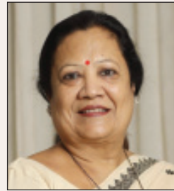
Smt. Darshana V Jardosh Union Minister of State for Railways and Textiles, Govt. of India

IHGF Delhi Fair has grown over the years to become one of the most reputed and successful fairs for products of the cottage sector, and there is a lot of enthusiasm amongst overseas buyers for this multi-products fair. The continuous efforts of EPCH have helped the Indian handicrafts sector grow, highlighting their exquisiteness and projecting India as a reliable supplier.