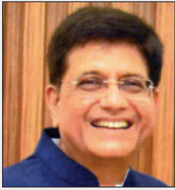
Shri Piyush Goyal Union Minister of Commerce & Industry, Consumer Affairs, Food & Public Distribution and Textiles, Govt. of India

The Indian handicrafts industry not only contributes significantly to the country's economy but also plays a vital role in preserving traditional skills and promoting sustainable livelihoods. The development of this industry is in line with Hon'ble Prime Minister Shri Narendra Modi ji's vision of 'Vocal for Local' and 'Make in India' for the World. This fair which will involve participation of around 3,000 Indian