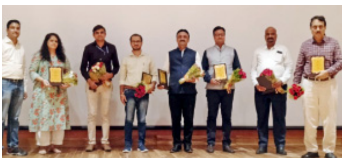
The panelists at the panel discussion held during National MSME Conclave 2023, IIT, Karwar, Jodhpur

A panel discussion on 'Strengthening Handicraft Design-Development-GI- Export' was conducted during the two days National MSME Conclave 2023 and Vendor Development Program. This discussion was organised by Ministry of MSME, Government of India in association with EPCH, District Industries Centre (DIC), O/o Development Commissioner (Handicrafts), NIFT, FDDI, IIT, ECGC, ONGC, NABARD and others Government and private sector organisations on 22 September 2023.