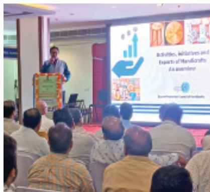
EPCH NWR representative shared information about handicrafts export promotional schemes