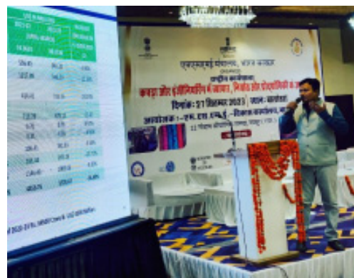
EPCH NWR representative shared information about handicrafts export promotional schemes