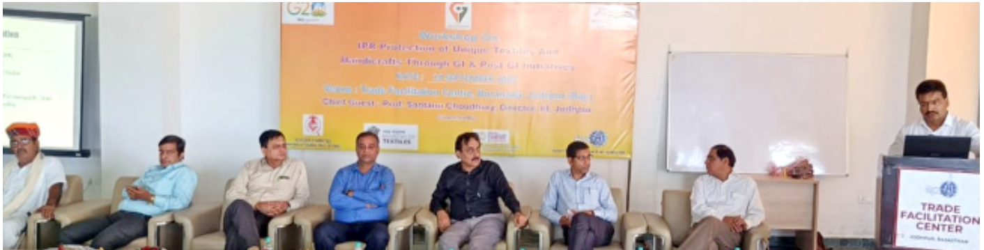
A glimpse of the dais with the dignitaries at the workshop held at TFC, Jodhpur

Workshop at Jodhpur, Rajasthan; 14 th September 2023