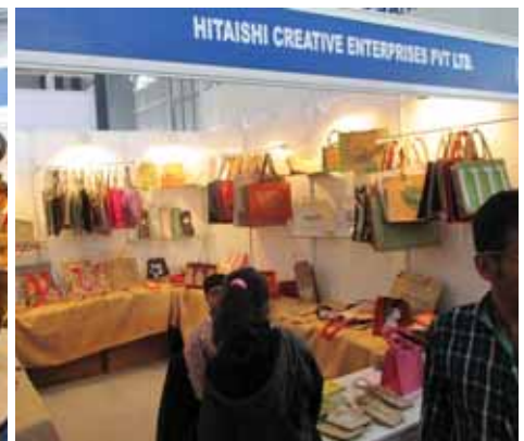
Glimpses of EPCH member exporters' stalls at the Vibrant Gujarat Global Trade Show