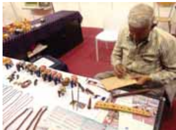
Left : a live crafts demonstration at the Indian Pavilion at AF - L'Artigiano in Fiera