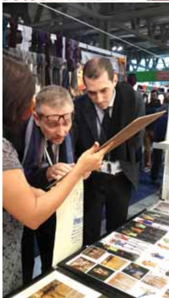
Below: Glimpses of stalls in the Indian Pavilion at the fair