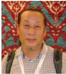
Kim, South Korea

I am a wholesaler dealing in furniture. I am a regular visitor to this show. This time I am looking for both modern and antique furniture. I liked the variety of products displayed. I am particularly interested in bookshelves that I saw. I will surely visit the IHGF Delhi Fair -Autumn 2014. I am very satisfied with the arrangements in this fair.