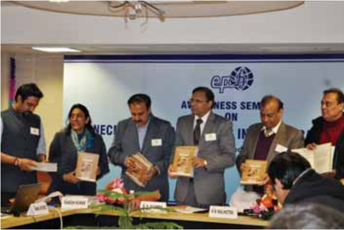
Release of "Guidance Handbook for the Handicrafts Exporters of India - Socio Legal Standards" in 11 regional languages