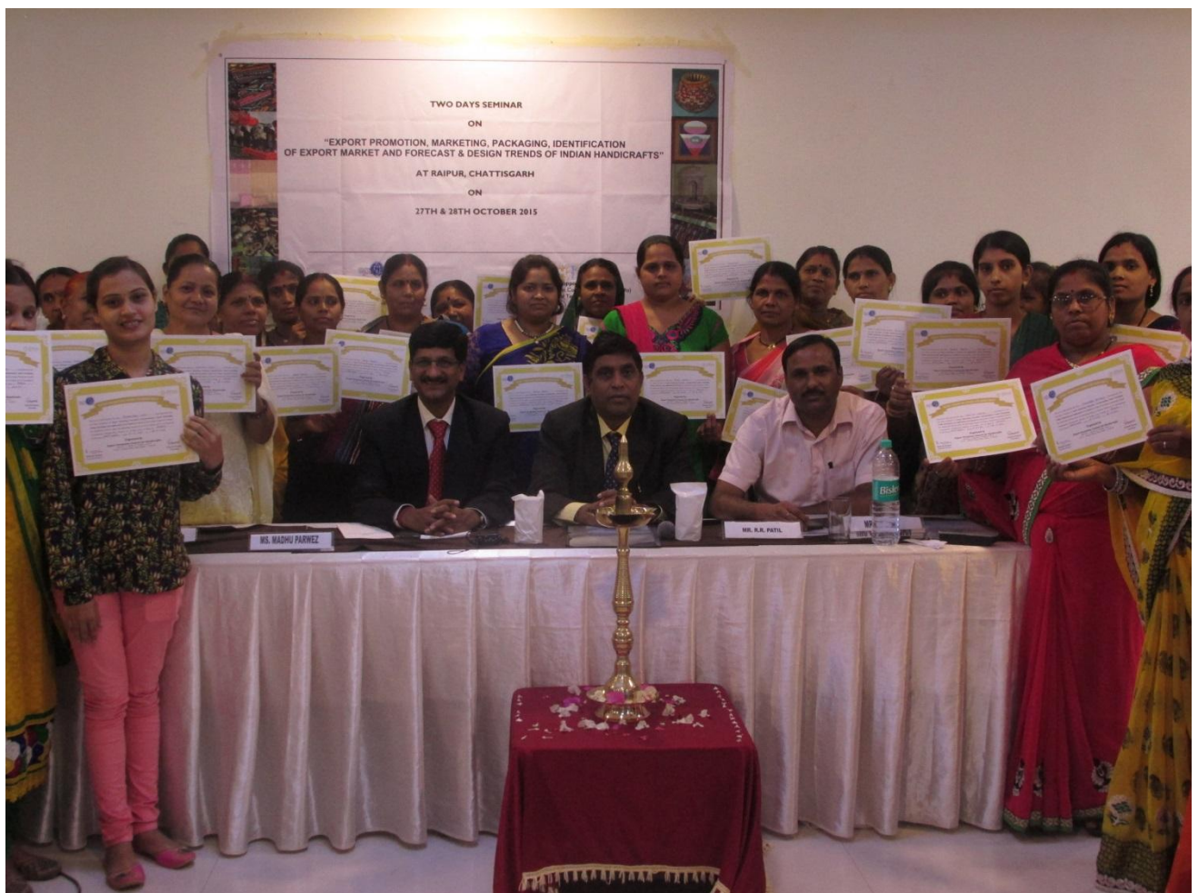
The group photo.

The two days sessions were closed with the certificate distribution to participants and vote of thanks by Handicrafts Promotion Officer, D.C(Handicrafts), Jagdalpur.