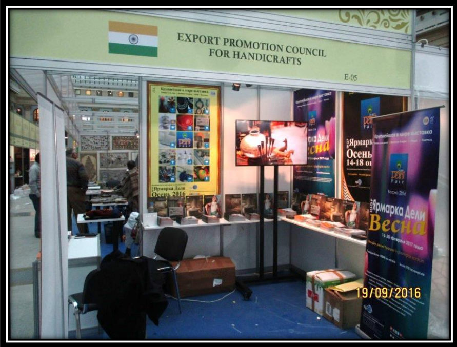
EPCH booth during Gift Expo-Autumn 2016, Moscow Russia